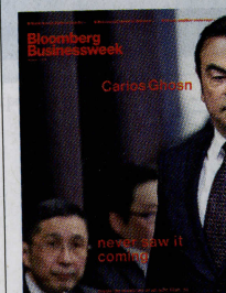
Cover: Eugene Hoshiko/ AP Photo