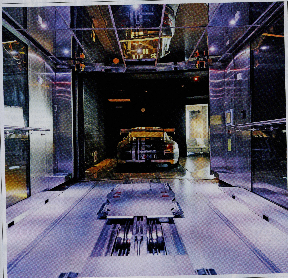
◀ Inside the elevator that whisks owners—and their cars—to apartments in the Porsche Design Tower in Sunny Isles Beach, Fla.