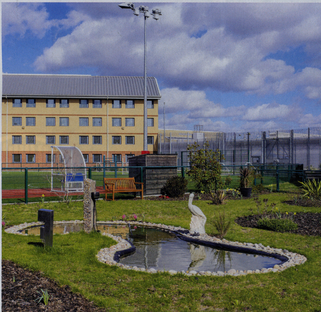
37 A banished billionaire could sway the Thai elections 38 Washington's cop museum, open since October, is a bust