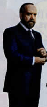
Paul Giamatti in Billions , page 59

68 | 7 Questions with World Economic Forum founder Klaus Schwab