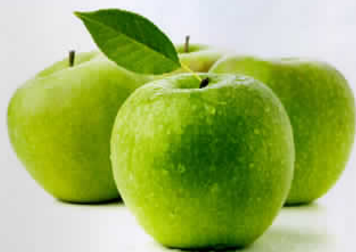
The other guy.