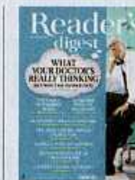
PHOTOGRAPH BY DAN SAELINGER; PROP STYLIST: BEKKA MELINO; HAIR & MAKEUP: AMY GILLESPIE