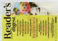
ILLUSTRATION BY VALERO DOVAL