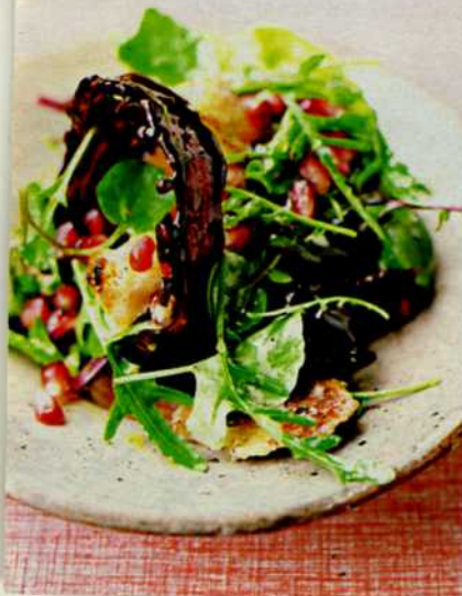
15 Jamie Oliver's favorite Christmas salad