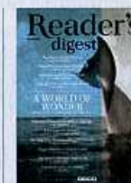
FEATURED IN OUR WONDER ESSAY