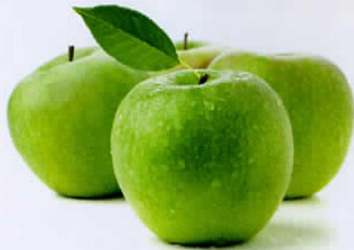
The other guy.