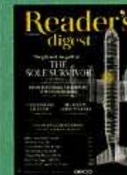
ILLUSTRATION BY BRYAN CHRISTIE DESIGN