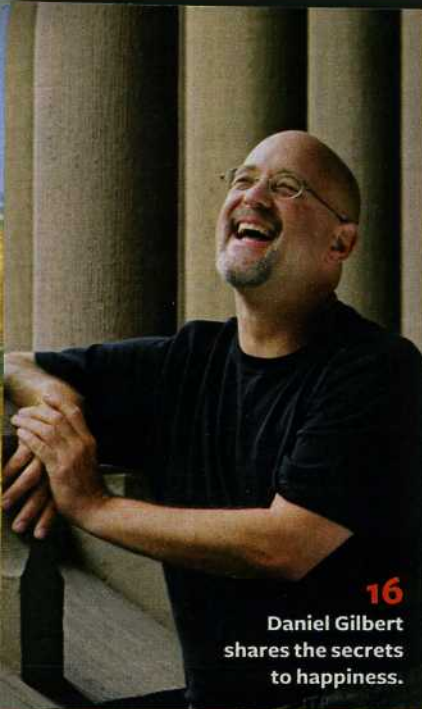
16 Daniel Gilbert shares the secrets to happiness.