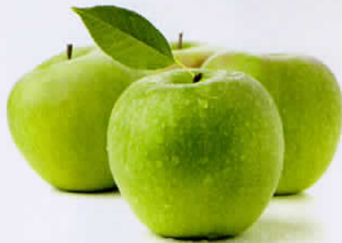
The other guy.