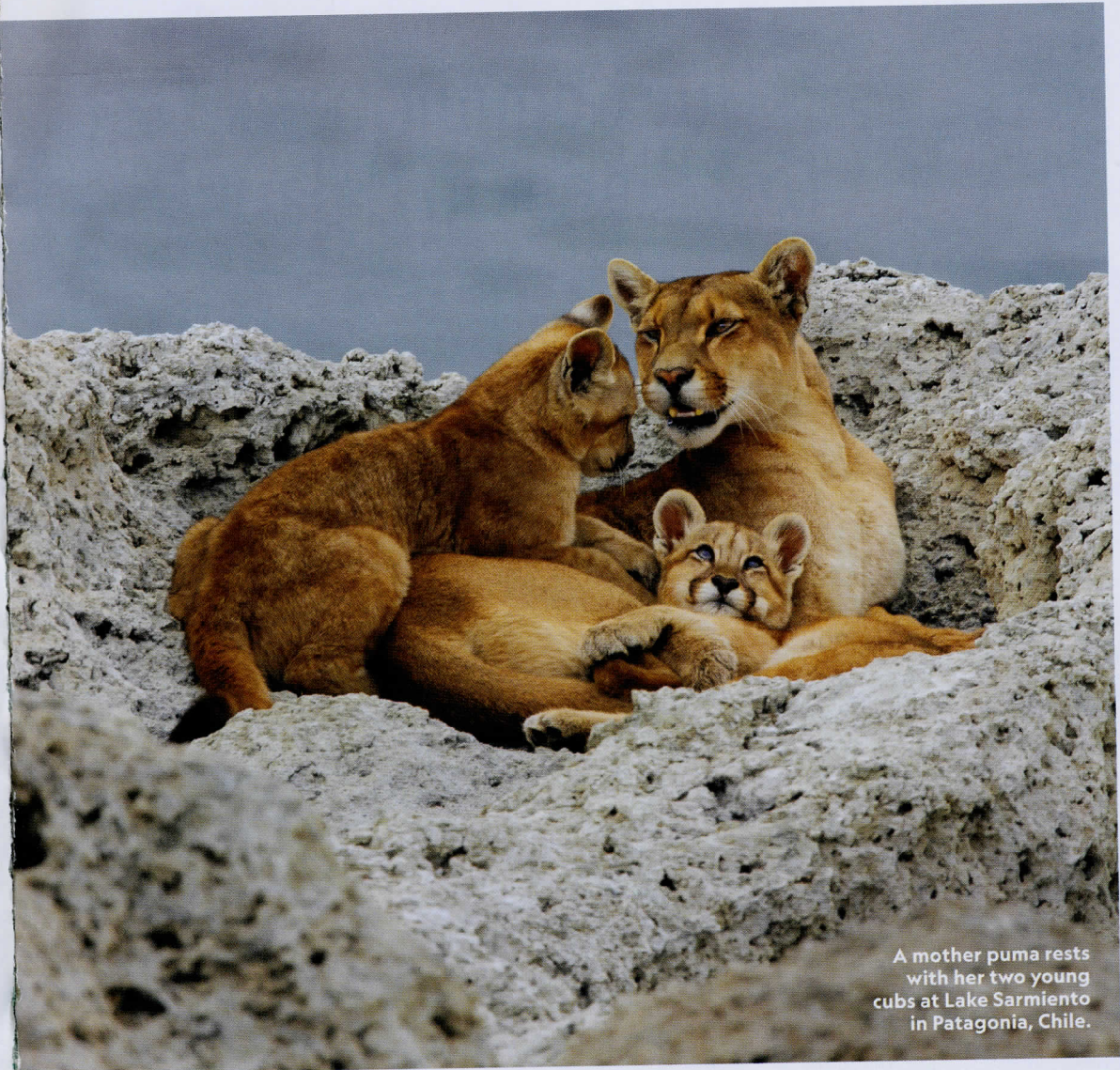
A mother puma rests with her two young cubs at Lake Sarmiento in Patagonia, Chile.