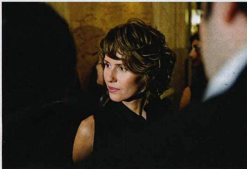
MY TOXIC TIME WITH SYRIA'S FIRST LADY PAGE 36