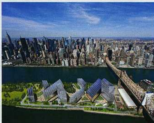
NEW YORK'S TECH RACE PAGE 44