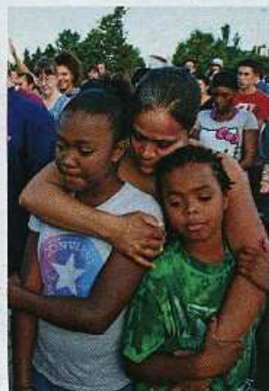
A KILLER'S TOLL PAGE 30