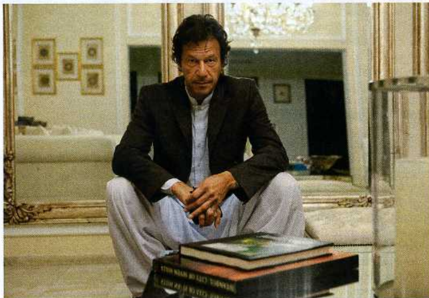
IMRAN KHAN, PAKISTAN'S NEXT PRIME MINISTER? PAGE 24