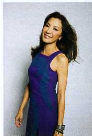
BECOMING "THE LADY" PAGE 53