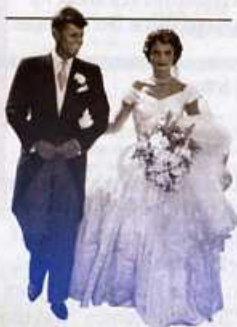
A-list bridal wars Page 24

Misrata burns; Hillary lands in South Korea.