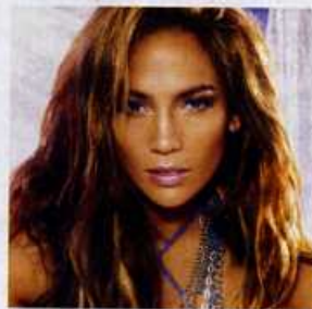
Is this your diva? Page 54