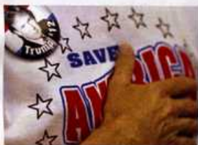
Trump's free ride is over Page 13