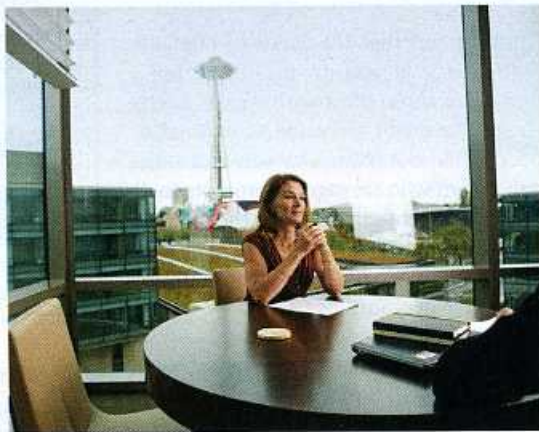
MELINDA GATES'S NEXT CRUSADE PAGE 44