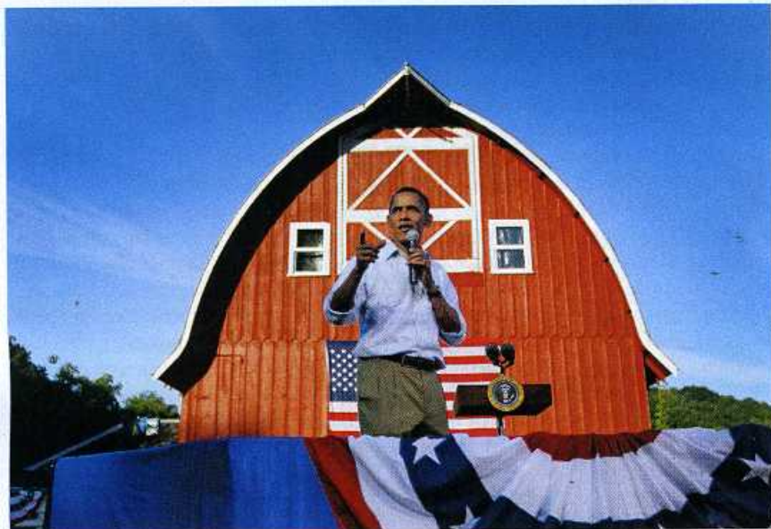
OBAMA'S SUSPECT POPULIST CLAIMS PAGE 26

'Ryan Seacrest trades on being an outsider with access—he's in the celebrity world, but not necessarily of it.'