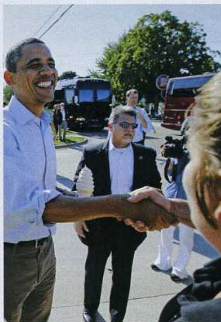
Team Obama's campaign juggernaut Page 38

A Chinese winter wonderland; adoption in Congo; the most annoying TV show ever.