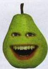
Coming to a TV near you! Page 17

Farewell, Dear Leader: Kim Jong-il's funeral.