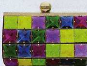
A stylist's preppy picks Page 63