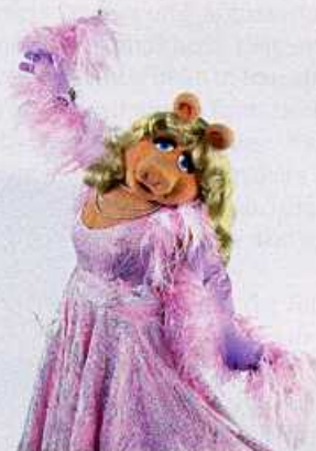
Why Whoopi loves the Muppets Page 60