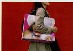
How to spend $873 billion Page 25

Clinton's Asian charm offensive; a Vegas nail-biter.