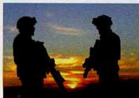
Washington's risky cuts Page 3