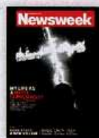
ON THE COVER:

READ BREAKING NEWS, ANALYSIS, AND OPINION ON NEWSWEEK'S WEB ANIMAL