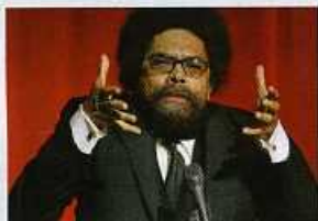
Cornel West takes on Obama Page 14