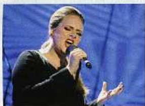
Adele hits a high note Page 20

The missing Republican; the Dalai Lama passes the torch.