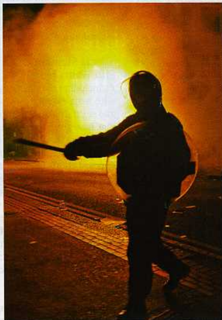
What's driving Britain's riots? Page 36

From Cuomo to Kutcher, the summer's winners; Obama's book club.