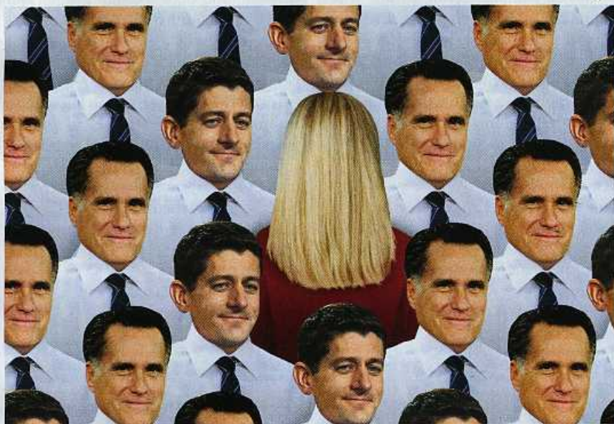
IT'S HARD TO BE A WOMAN IN THE GOP PAGE 34

'Brahimi judges his own chances of success in delivering peace to Syria as very slim.'