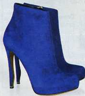
GET THESE BOOTIES PAGE 56