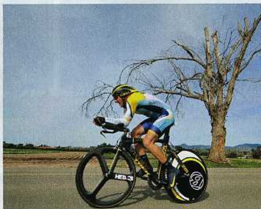
ARMSTRONG REMAINS A HERO TO MILLIONS PAGE 26