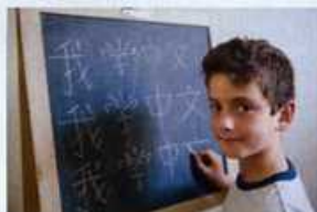
A boost for kids' brains Page 26

Wall Street takes a bath; Egypt gets its revenge.