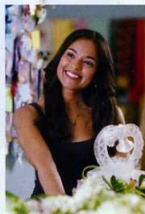
The 30 Minutes or Less scene-stealer gives slackers hope for love Page 58

BOOKS: What if a Muslim designed the 9/11 memorial?