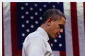
Obama in Jeopardy Page 9