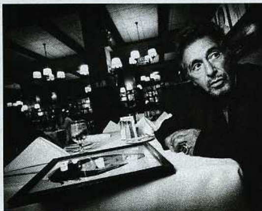
UP NEXT FOR PACINO: GLENGARRY GLEN ROSS PAGE 44