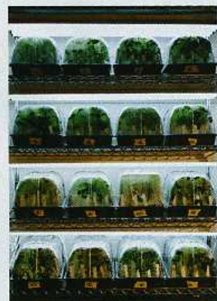
LEGITIMIZING WEED PAGE 26