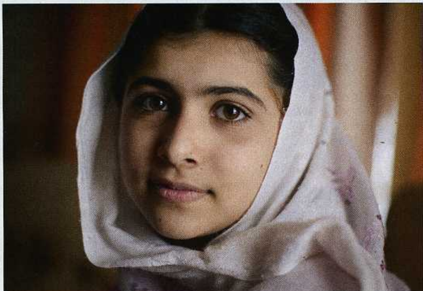
ONE GIRL'S FIGHT AGAINST THE TALIBAN PAGE 38