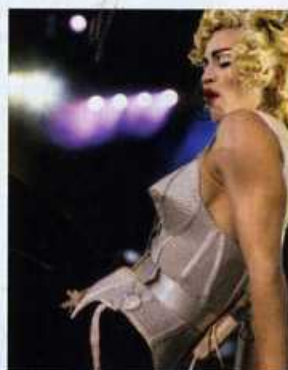
The designer who defined Madge Page 76

BOOKS: How the South almost won the Civil War.