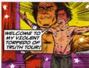
The downfall of Charlie Sheen Page 72

Michelle Obama tours Africa; Galliano's shame.