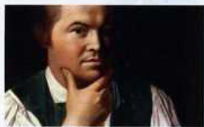
Our unelectable Founders Page 4