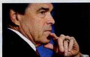
His own worst enemy Page 8