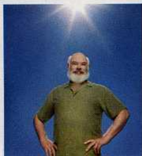
Go outside to get happy Page 9

Breaking up with your bank; the best political feuds; Groupon's wild ride; Chris Matthews's new JFK book.