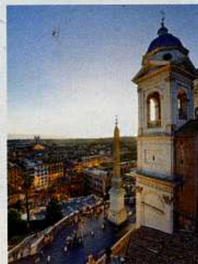
The Eternal City's inexhaustible newness Page 64