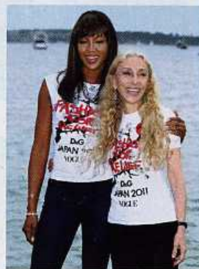
Franca Sozzani shakes up style Page 54

Pearl Jam bares all in a new rock doc; All My Children bids farewell; The Hour makes tweed sexy.