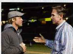
Brad Pitt's real-life model Page 22

Lightning-fast Usain Bolt; Amanda Knox's new hope.