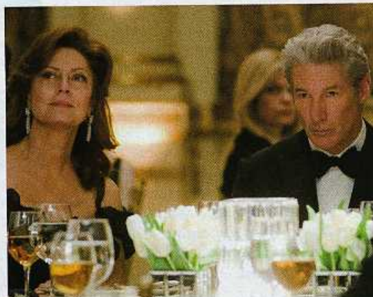
WHAT WE CAN LEARN FROM 'ARBITRAGE' PAGE 26