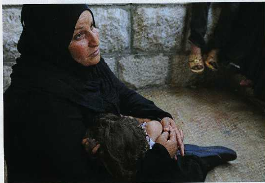
THE SYRIANS NEED US PAGE 32

'The sudden ascent of Al-Sisi from the shadows of military intelligence is part of a calculated power play by Egypt's newly elected president.'