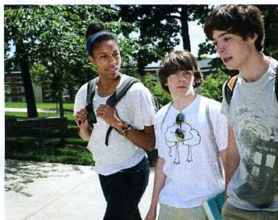
WHICH HIGH SCHOOL IS NO. 1? PAGE 34