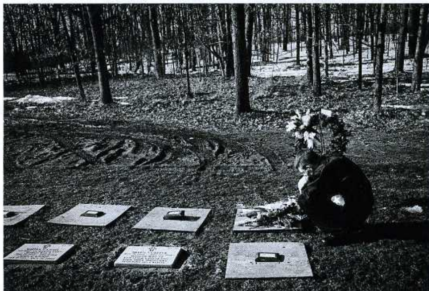
WHEN THE DEADLIEST WAR INJURY IS SUICIDE PAGE 26

'Fotouh, who helped lead Egypt's Muslim Brotherhood for 25 years, is now a contender for the country's presidency.'