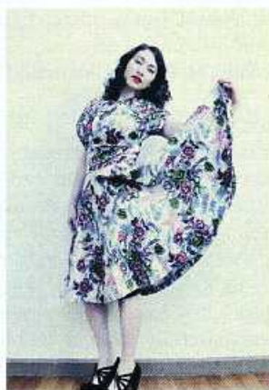
SPEKTOR SINGS PAGE 51