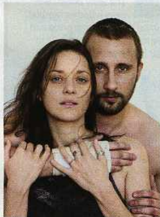
'RUST AND BONE' PAGE 51