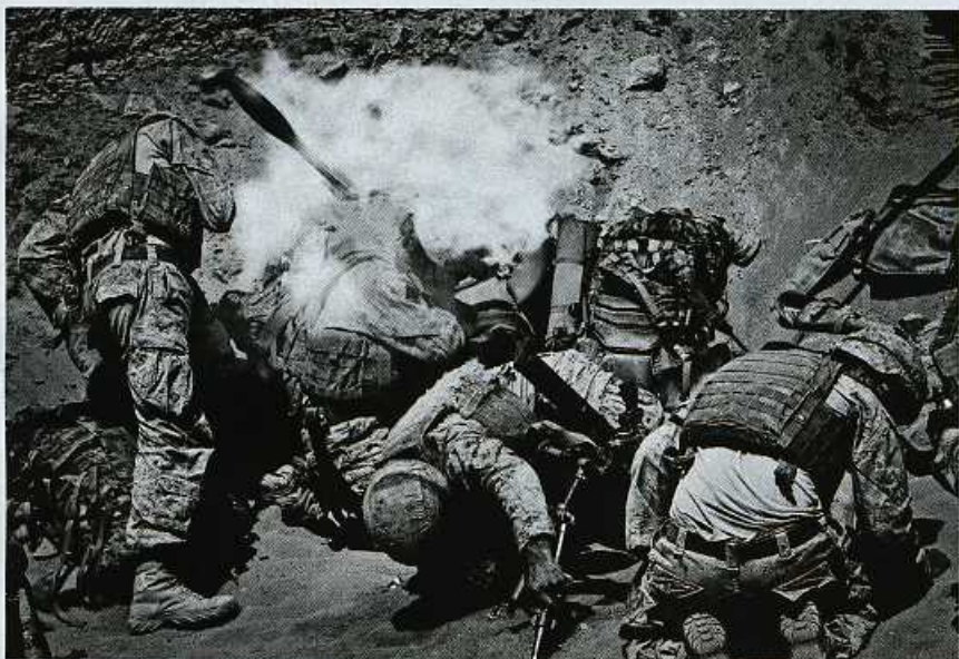
WHAT HAUNTS SOLDIERS' SOULS PAGE 40

'GOP heavyweights have reason to worry about what Chris Chocola thinks.'