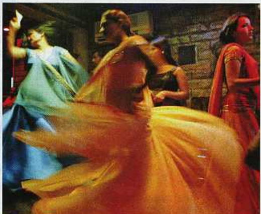
CHRONICLING BOMBAY'S DANCE BARS PAGE 54