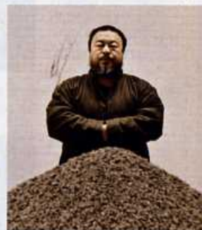
A dissident's dangerous art Page 50

Broadway's World War I epic; Will and Kate slept here.