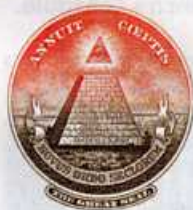
Wall Street's rogues' gallery Page 22

Syria grieves; Obama lets his frustration show.