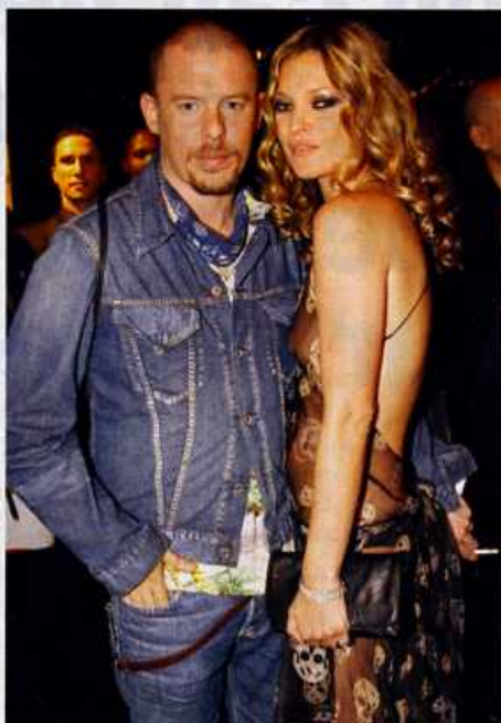
Remembering the talents of a fashion icon Page 36

Deval Patrick versus Mitt Romney; how to live forever.