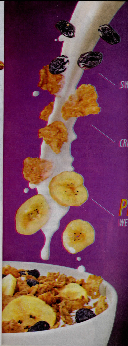
FROM LEFT: HORTIMAGES/SHUTTERSTOCK; ERMOLAEV ALEXANDER/SHUTTERSTOCK; ILLUSTRATION BY SERGE BLOCH

Send letters to letters@rd.com or Letters, Reader's Digest, PO Box 6100, Harlan, Iowa 51593-1600. Include your full name, address, e-mail, and daytime phone number. We may edit letters and use them in all print and electronic media. Contribute your True Stories at rd.com/stories. If we publish one in a print edition of Reader's Digest, we'll pay you $100. To submit humor items, visit rd.com/submit, or write to us at Jokes, 44 South Broadway, 7th Floor, White Plains, NY 10601. We'll pay you $25 for any joke, gag, or funny quote and $100 for any true funny story published in a print edition of Reader's Digest unless we specify otherwise in writing. Please include your full name and address in your entry. We regret that we cannot acknowledge or return unsolicited work. Requests for permission to reprint any material from Reader's Digest should be sent to permissions@tmbi.com. Get help with questions on subscriptions, renewals, gifts, address changes, payments, account information, and other inquiries at rd.com/help, or write to us at customer@rd.com or Reader's Digest, PO Box 6095, Harlan, Iowa 51593-1595.