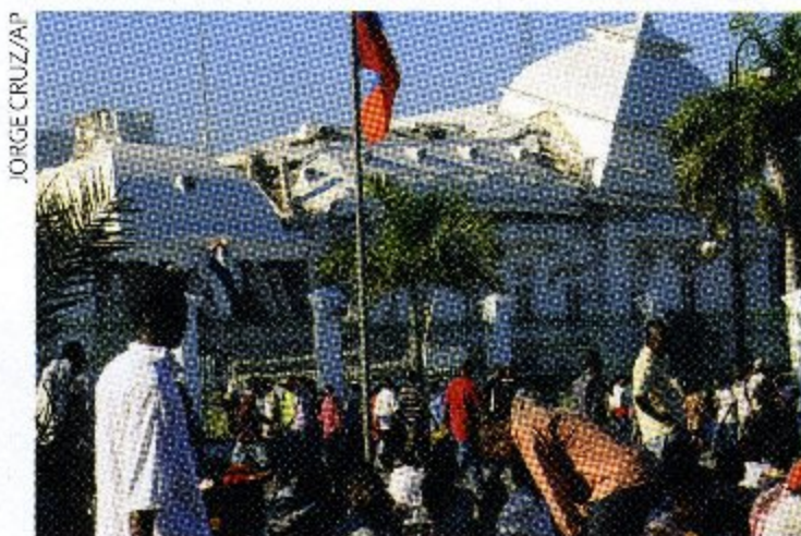
Haiti disaster: what can the geologists tell us? News, p. 276.