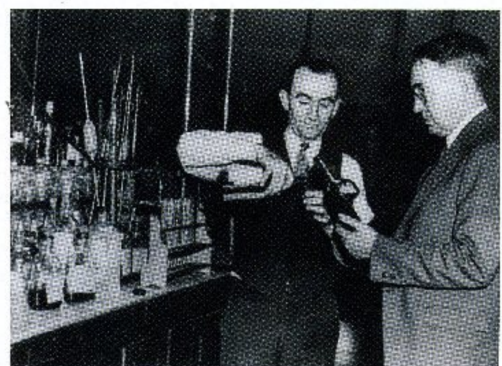
What's your poison? Toxicology meets Prohibition, p. 299.