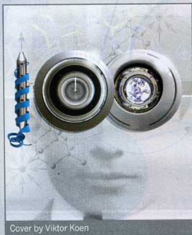
Cover by Viktor Koen