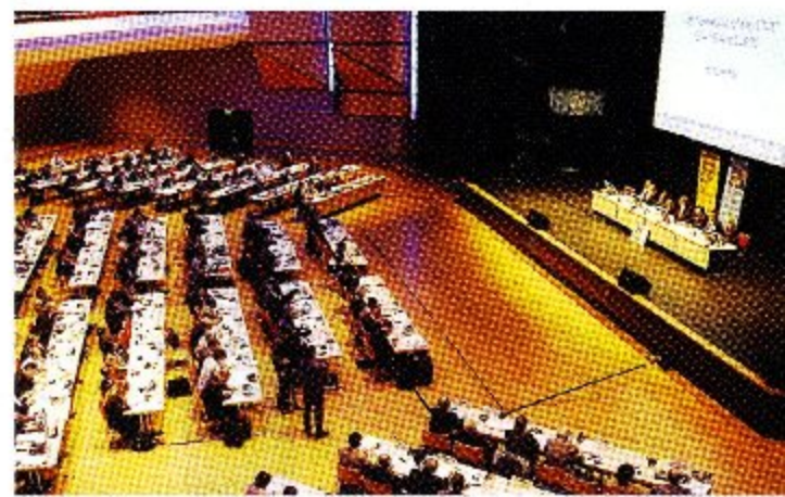
Up for discussion: shaping the IPCC for the future, p. 730.