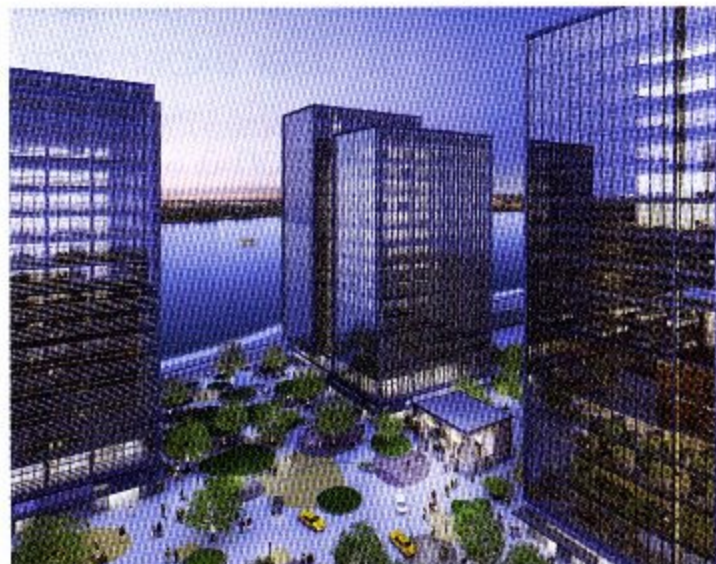
East Side story: a new focus for New York biotech, p. 836.