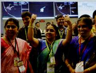
Staff from the Indian Space Research Organisation (ISRO) celebrate on 14 September 2014 after the Mars Orbiter Spacecraft successfully entered into orbit around Mars.