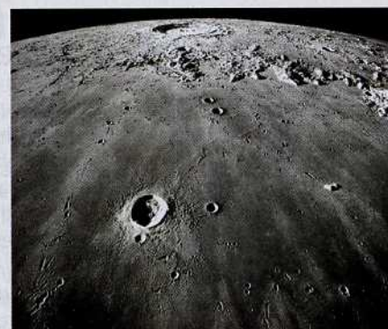
pages 365 &amp; 400