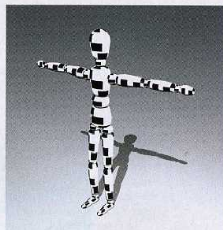
pages 821 &amp; 844