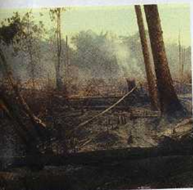
pages 1518 & 1573