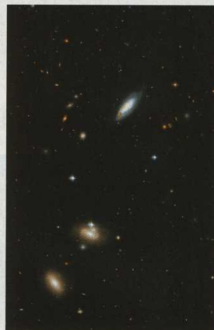
pages 40 &amp; 53