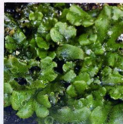
pages 623 & 645