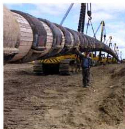
pages 1462 &amp; 1491