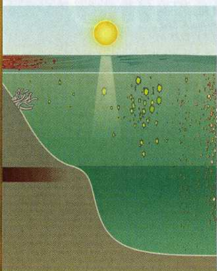
pages 1176 & 1223