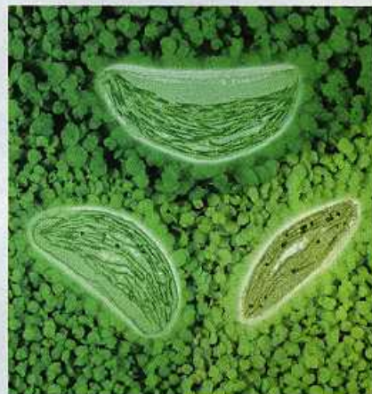
pages 622 &amp; 655