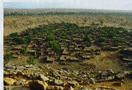
pages 617 & 682