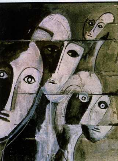
pages 1177 & 1190