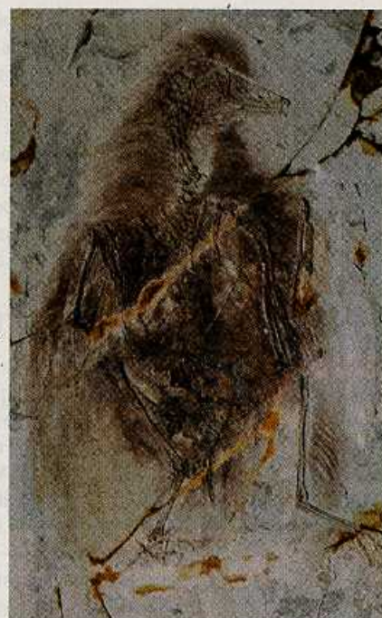
pages 1261 & 1309