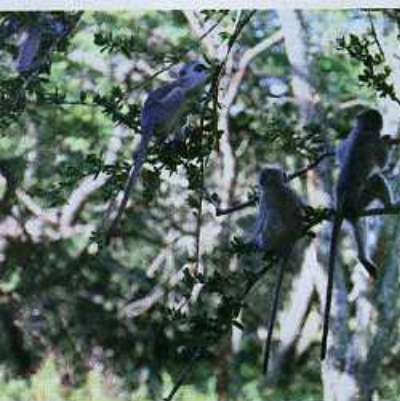
pages 437, 483, &amp; 485