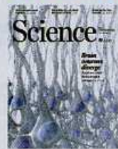
Illustration of projection neurons from the human cerebral cortex, with nuclei colored to reflect distinct sets of somatic DNA mutations. When a mutation occurs in a dividing cell, it marks

all of the cell's descendants. Identification of clones marked by mutation enables reconstruction of human brain development. Because developmental defects lie at the heart of many neurological diseases, understanding development is a primary goal of neuroscience. See pages 37 and 94. Illustration: C. Bickel/Science