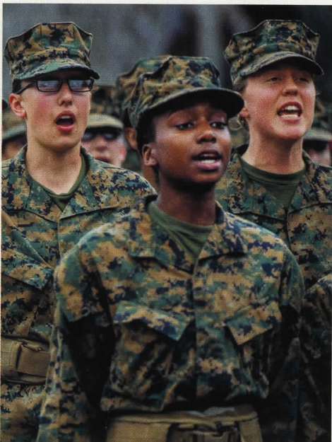
All female marine recruits pass through Parris Island, South Carolina, for boot camp. Men and women at the base once had different training regimens; now they're the same.

BY NILANJANA BHOWMICK