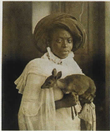
A Kenyan woman with her pet, a juvenile antelope

National Geographic's archive contains millions of images. Consider what they reveal about the lives of women. PAGE 34 BY SARAH LEEN