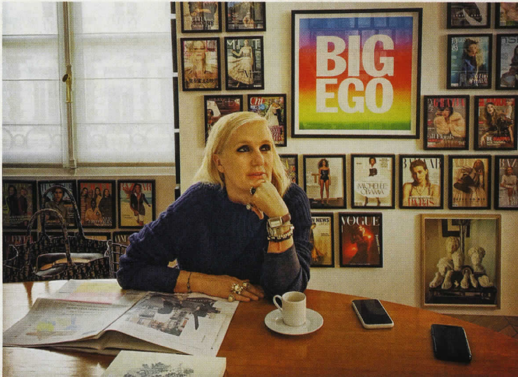
Maria Grazia Chiuri is the first woman creative director in the Dior fashion house's 72-year history.