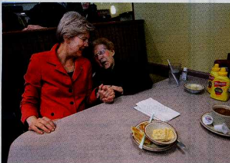
Senator Elizabeth Warren at the Bluebonnet Diner in Northampton, Mass.